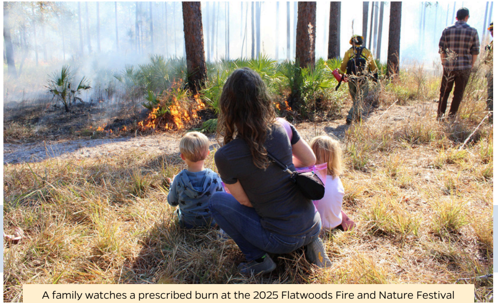
A family watches a prescribed burn at the 2025 Flatwoods Fire and Nature Festival on Feb. 1.