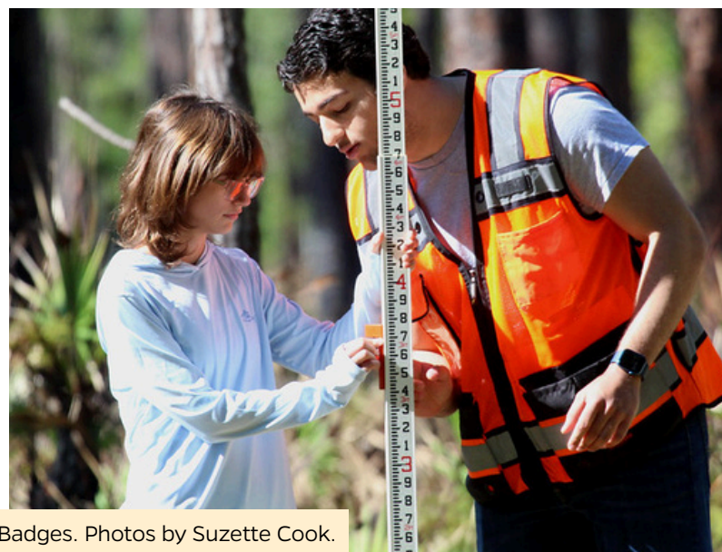
Scouts earn their Surveying Merit Badges.