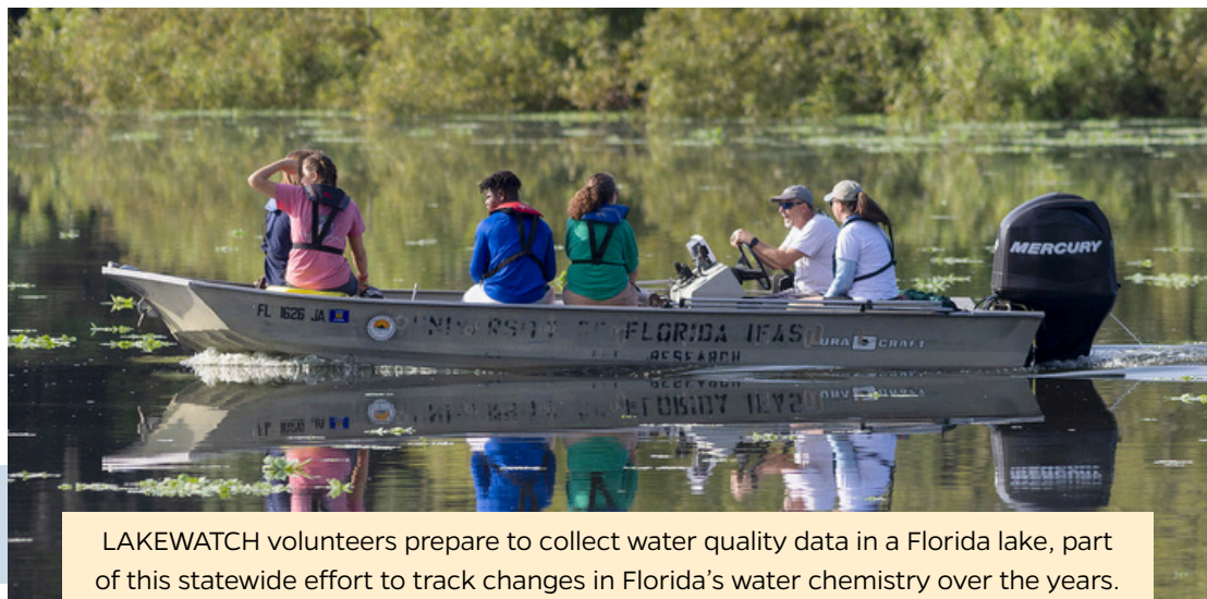
LAKEWATCH volunteers prepare to collect water quality data in a Florida lake, part of this statewide effort to track changes in Florida's water chemistry over the years.