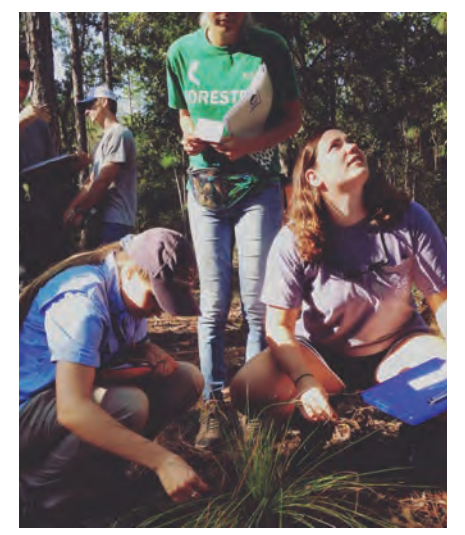
Students explore pine growth at the Austin Cary Forest during a silviculture course field trip.