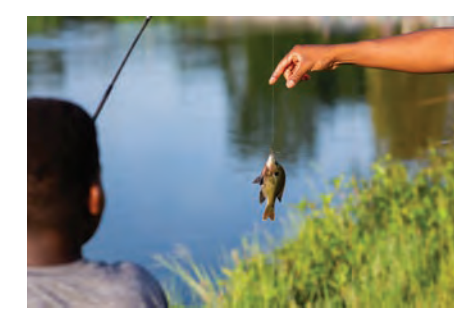
Catching a fish from Fisheries and Aquatic Sciences' many stocked ponds during Family Fishing Day, a monthly public outreach event.

Opposite page. Pine trees marked for removal for timber or management purposes at the 2,600 acre Austin Cary Forest in Gainesville, Florida.