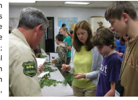
The 4H Forest Ecology contest brings together chapters from across Florida to compete in the identification of plants, wildlife, pests and disease issues, and related. Workshops to help students and their advisors with the finer points of the contest material involve a variety of collaborators, including the Florida Forest Service.

Below. Fishing boats lined up on a Caribbean shore, where Fisheries and Aquatic Sciences faculty and graduate students work with local