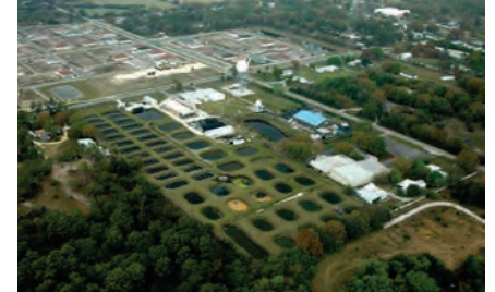
he Tropical Aquaculture Lab in located south of Tampa, in the heart of the ornamental aquaculture region of the state. In addition to the fish ponds visible here, the facilities include enclosed tanks used to study the production of a variety of freshwater and marine species.

Opposite. A black bear meanders through the Austin Cary Forest.