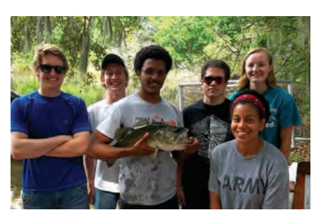
Courses utilize Lake Alice, located in the center of main campus, for several courses. Here, students pose with a largemouth bass collected (and then released) during sampling exercises.

Through its large network of collaborators, partners and audiences, our overall Extension program is well positioned for continuing the legacy of strong science delivery and application.